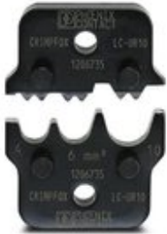
Crimp insert for tube lugs, 4.0 - 10.0 mm 2

Please be informed that the data shown in this PDF Document is generated from our Online Catalog. Please find the complete data in the user's documentation. Our General Terms of Use for Downloads are valid ( http://phoenixcontact.com/download )